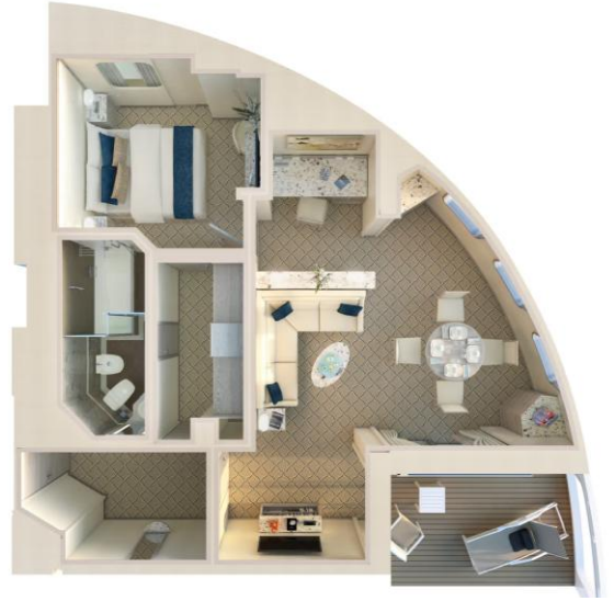
Silver Suite (581 SQ. FT.) $32,500 $25,290 per person *