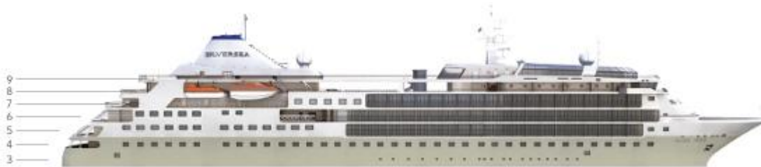
SILVER WIND – Deck Plan