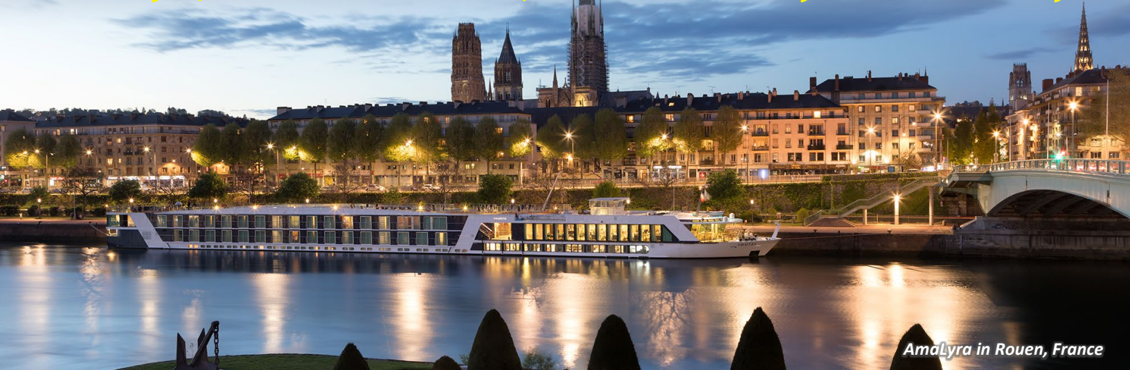
Amalyra in Rouen, France

ABOARD AMALYRA • 7 NIGHTS • JUNE 18 TO 25, 2026