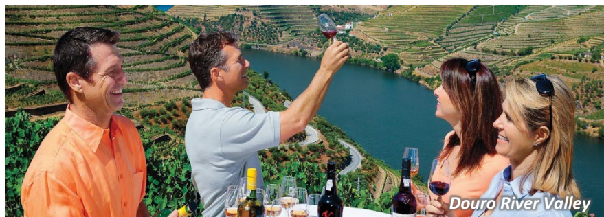
Douro River Valley