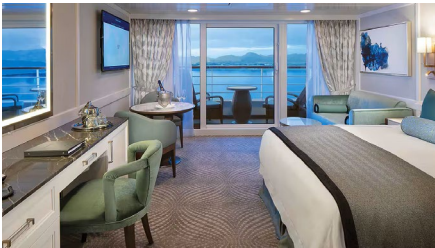
Penthouse Suite Approx. 440 ft 2 (incl balcony) from $7,998 pp