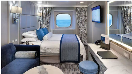
Deluxe Ocean View Stateroom Approx. 165 ft 2 from $4,448 pp

With a maximum of only 670 guests, the reimagined Oceania Insignia blends sophistication with a contemporary flair to create a casually elegant ambiance that embodies the most treasured elements of our celebrated ships. Every surface of every suite and stateroom is entirely new, while in the public spaces, a refreshed color palette of soft sea and sky tones surrounds a tasteful renewal of fabrics, furnishings and lighting fixtures that exquisitely encompasses the inimitable style and comfort of Oceania Cruises.