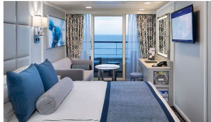
Veranda Stateroom Approx. 291 ft 2 (incl balcony) from $5,998 pp