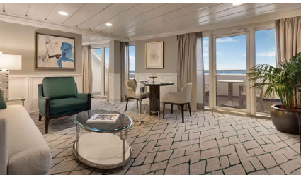
Vista Suite Approx 1450 ft 2 (incl balcony) from $12,098 pp