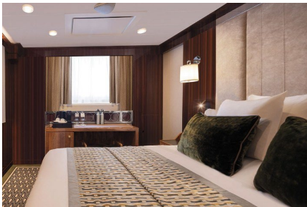
Oceanview Stateroom Approx. 183 ft 2 from $12,708 $6,799 pp