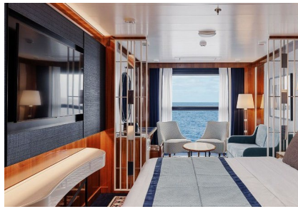
Horizon Stateroom Approx. 270 ft 2 from $14,108 $7,699 pp