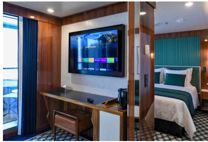
Navigator Suite Approx. 456 ft 2 (incl. balcony) from $28,108 $14,999 pp