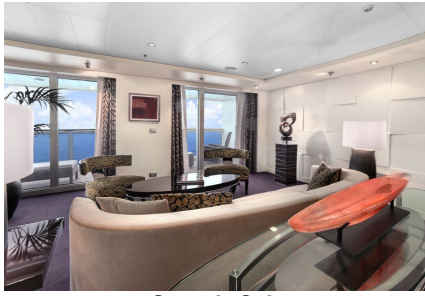
Oceania Suite Approx. 1,000 ft 2 (w blcny) from $14,198 USD