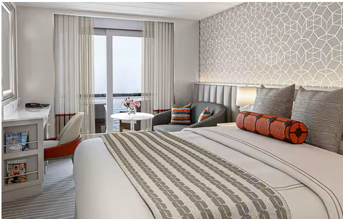
Veranda Stateroom Square footage: Approx. 291 sq ft (incl balcony) Category B4 to B1

Category B4 $6,898 $3,648 pp Category B3 $6,998 $3,698 pp Category B2 $7,098 $3,748 pp Category B1 $7,198 $3,798 pp