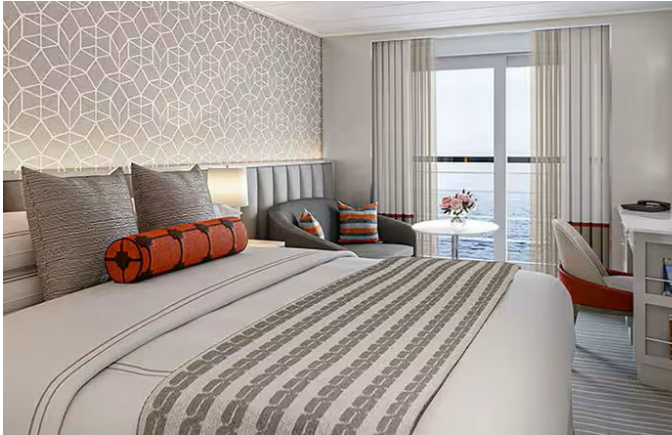
French Veranda from $5,598 $2,998 pp Square footage: Approx. 240 sq ft Category B5

Special Pricing when you book by February 28, 2026