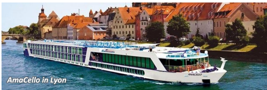
AmaCello in Lyon