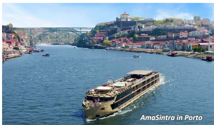
AmaSintra in Porto

Save Up To $500 pp When You Book By January 31, 2026!