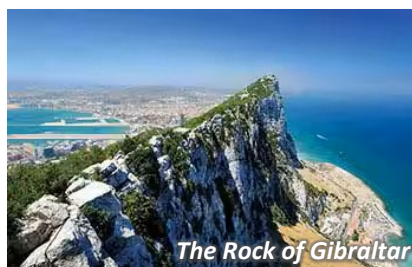
The Rock of Gibraltar

SPECIAL PRICING when you book by February 28, 2026!