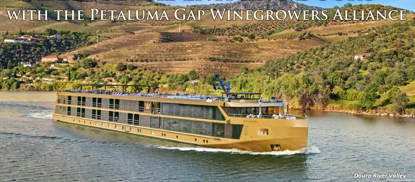
Douro River Valley

ABOARD AMASINTRA • 7 NIGHTS • MAY 14 TO 21, 2027 PORTO • RÉGUA • BARCA D'ALVA • VEGA DE TERRÓN • PINHÃO • ENTRE-OS-RIOS • PORTO