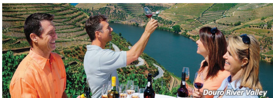
Douro River Valley