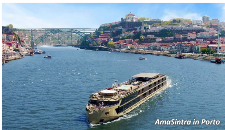
AmaSintra in Porto

Save Up To $500 pp When You Book By December 31, 2025!