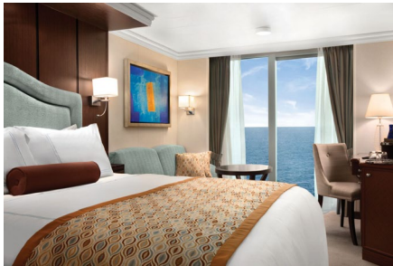
Deluxe Ocean View Approx. 242 ft 2 from $5,148 USD

Set sail aboard Oceania Riviera for a wine cruise experience that will be truly unique. Oceania Cruises' beautiful 1,250 passenger Riviera will be your home. Enjoy the unique experience of a smaller ship, which features large, well-appointed staterooms with floor to ceiling windows. Renowned for their culinary excellence, Oceania Cruises is our choice for exclusive wine cruises. Destination focused with like-minded travelers, Oceania Riviera is the perfect setting!