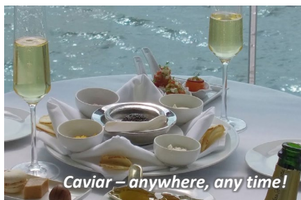
Caviar – anywhere, any time!