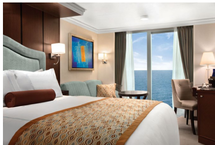
Deluxe Ocean View Approx. 242 ft 2 from $5,148 USD

Set sail aboard Oceania Riviera for a wine cruise experience that will be truly unique. Oceania Cruises' beautiful 1,250 passenger Riviera will be your home. Enjoy the unique experience of a smaller ship, which features large, well-appointed staterooms with floor to ceiling windows. Renowned for their culinary excellence, Oceania Cruises is our choice for exclusive wine cruises. Destination focused with like-minded travelers, Oceania Riviera is the perfect setting!