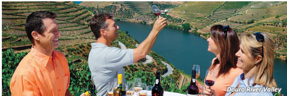
Douro River Valley