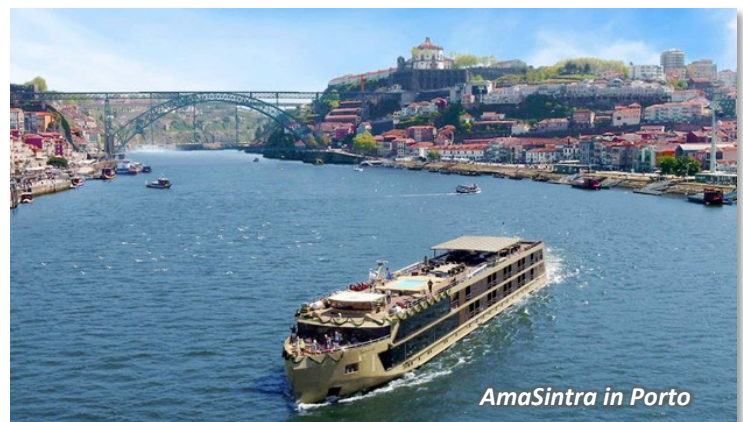
AmaSintra in Porto

Save Up To $500 pp When You Book By October 31, 2025!