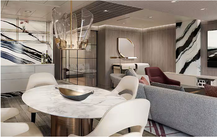
Oceania Suite $16,198 $8,498 pp Square footage: 1,000 to 1,200 sq ft (including balcony)

Amenities: Tranquility Bed with 1,000-thread-count linens; Complimentary soft drinks replenished daily in your refrigerated mini-bar; Complimentary still & sparkling Vero Water; Private teak veranda; Bulgari amenities; Room service menu 24 hours a day; Twice-daily maid service; Oversized rainforest shower; Belgian chocolates with turndown service; Interactive television system; Wireless Internet access and cellular service; Writing desk and stationery; Plush cotton towels; Thick cotton robes and slippers; Handheld hair dryer; Security safe