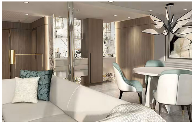
Vista Suite $17,598 $9,198 pp Square footage: 1,450 to 1,850 sq ft (incl balcony)

Amenities: Tranquility Bed with 1,000-thread-count linens; Complimentary soft drinks replenished daily in your refrigerated mini-bar; Complimentary still & sparkling Vero Water; Private teak veranda; Bulgari amenities; Room service menu 24 hours a day; Twice-daily maid service; Oversized rainforest shower; Belgian chocolates with turndown service; Interactive television system; Wireless Internet access and cellular service; Writing desk and stationery; Plush cotton towels; Thick cotton robes and slippers; Handheld hair dryer; Security safe