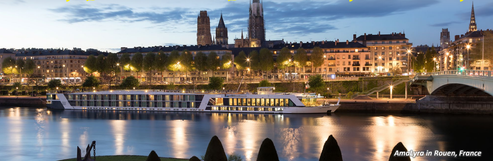
Amalyra in Rouen, France

ABOARD AMALYRA • 7 NIGHTS • JUNE 18 TO 25, 2026 Paris • Les Andelys • Le Havre • Caudebec-en-Caux • Rouen • Vernon • Paris