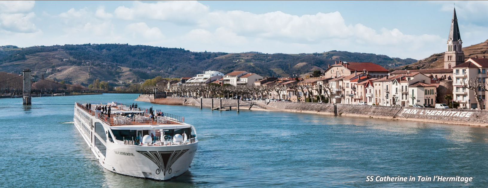
SS Catherine in Tain l'Hermitage

SS CATHERINE › 7 NIGHTS › LYON TO ARLES › APRIL 26 TO MAY 3, 2026