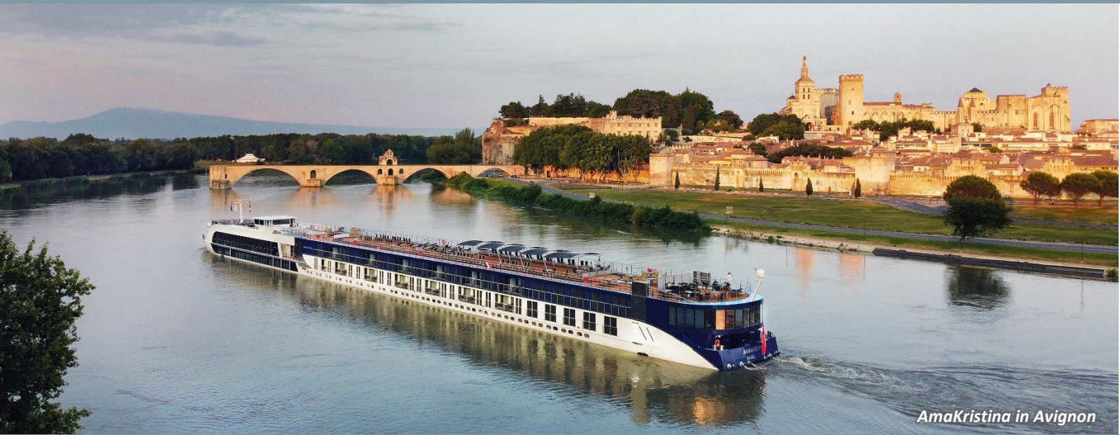
AmaKristina in Avignon

ABOARD AMAKRISTINA • 7 NIGHTS • APRIL 23 TO 30, 2026 Lyon • Vienne • Tournon • Viviers • Avignon • Arles