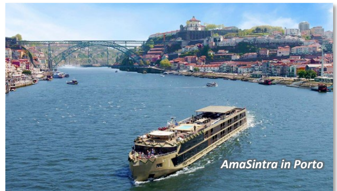
AmaSintra in Porto

Save Up To $500 pp When You Book By September 30, 2025!