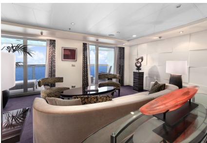
Oceania Suite Approx. 1,000 ft 2 (incl balcony) from $11,599