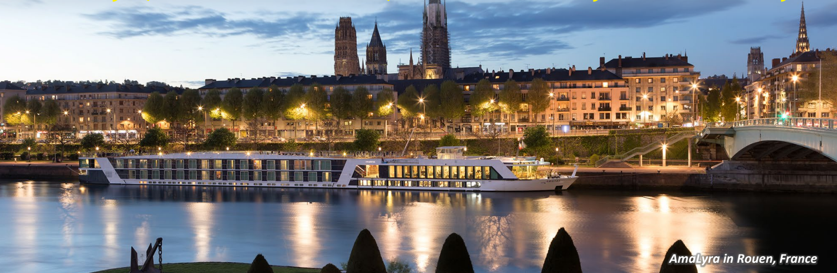
Amalyra in Rouen, France

ABOARD AMALYRA • 7 NIGHTS • JUNE 18 TO 25, 2026