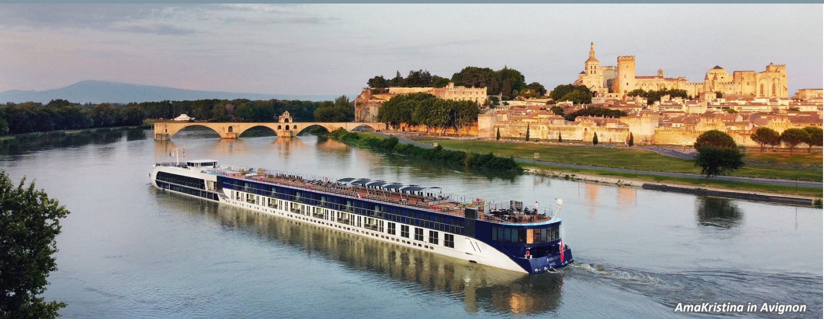
AmaKristina in Avignon

ABOARD AMAKRISTINA • 7 NIGHTS • APRIL 23 TO 30, 2026 Lyon • Vienne • Tournon • Viviers • Avignon • Arles