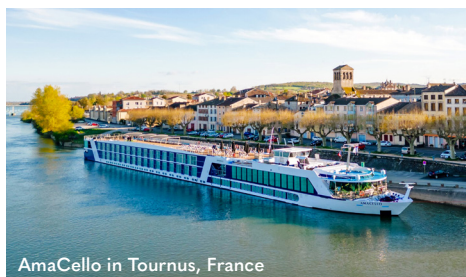
AmaCello in Tournus, France