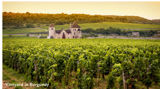
Vineyard in Burgundy

Cruise starting from $4,849 $4,249 per person