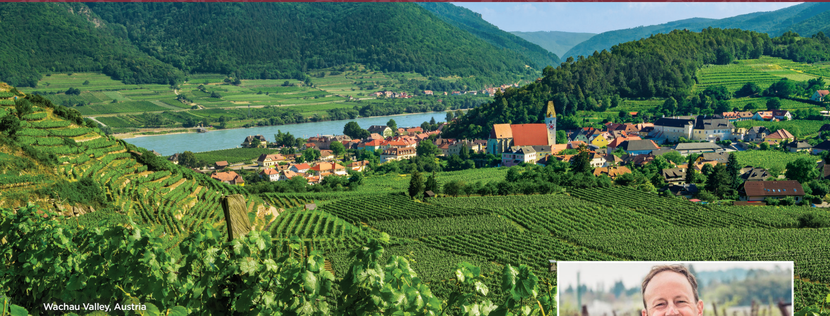
Wachau Valley, Austria

Uncork local traditions, savor intense flavors and enjoy palate-pleasing adventures during an AmaWaterways Wine Cruise