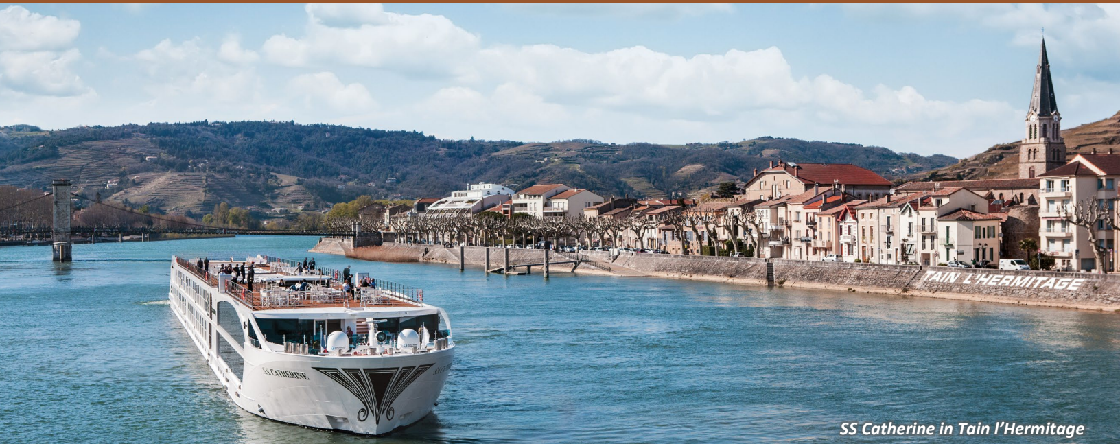
SS Catherine in Tain l'Hermitage

SS CATHERINE › 7 NIGHTS › LYON TO ARLES › JUNE 21-28, 2026