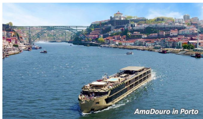
AmaDouro in Porto

Save Up To $450 pp When You Book By June 30, 2025!