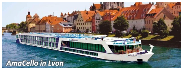
AmaCello in Lvon