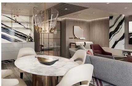
Oceania Suite Approx. 1,000 ft 2 (incl balcony) from $8,498