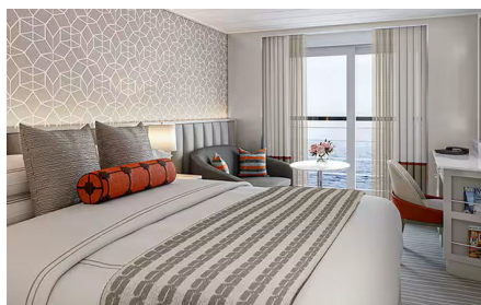
French Veranda Approx. 240 ft 2 from $3,098