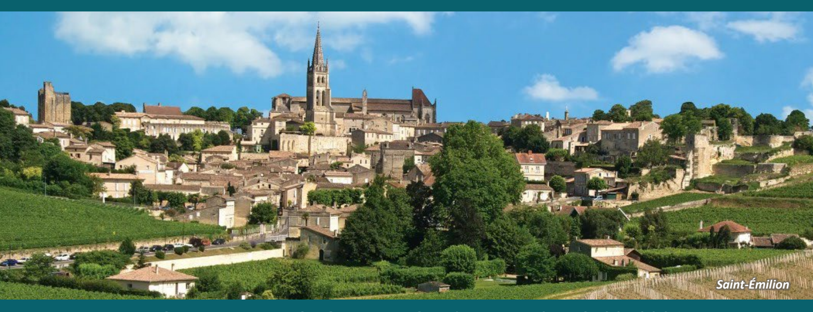
ABOARD AMADOLCE • 7 NIGHTS • MAY 21 TO 28, 2026 Bordeaux • Libourne • Blaye • Bourg • Cussac Fort Médoc • Cadillac • Bordeaux

Set sail with Mount Eden Vineyards, Ridge Vineyards, and the renowned Wines of the Santa Cruz Mountains as you journey through the legendary wine regions of Bordeaux! This extraordinary voyage begins in the heart of Bordeaux, the world's wine capital, offering an ideal backdrop to savor some of the world's most exquisite wines. Enjoy unforgettable tastings as you explore the prestigious vineyards of Saint-Émilion, Médoc, and Libourne, delving into centuries-old winemaking traditions. A highlight of your trip is a visit to the Bordeaux Wine Museum – a spectacular sensory experience that may inspire even the newest wine enthusiasts to become true connoisseurs. Pairing the world-class wines from Mount Eden and Ridge Vineyards with an exceptional culinary experience onboard, this journey promises an exclusive and unforgettable adventure for wine lovers!