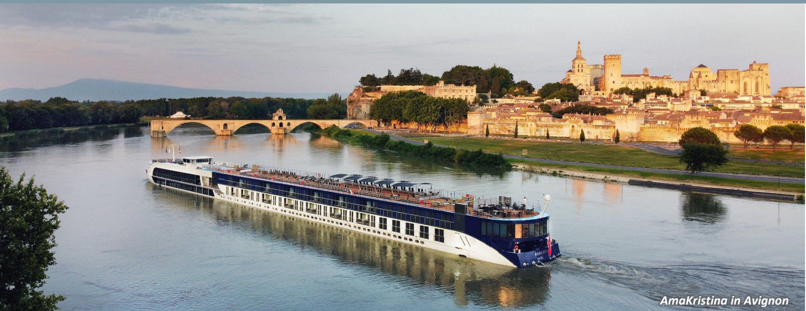
AmaKristina in Avignon

ABOARD AMAKRISTINA • 7 NIGHTS • APRIL 23 TO 30, 2026 Lyon • Vienne • Tournon • Viviers • Avignon • Arles