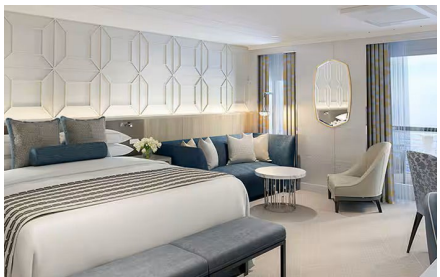
Penthouse Suite Approx. 440 ft 2 (incl balcony) from $5,398