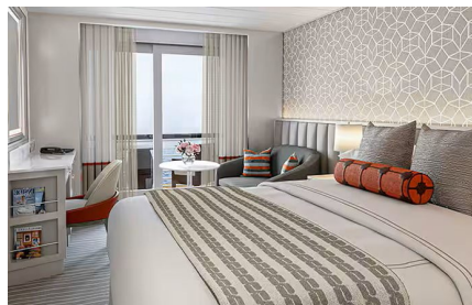
Veranda Stateroom Approx. 291 ft 2 (incl balcony) from $4,098