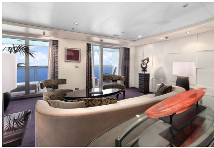
Oceania Suite Approx. 1,000 ft 2 (incl balcony) from $11,599