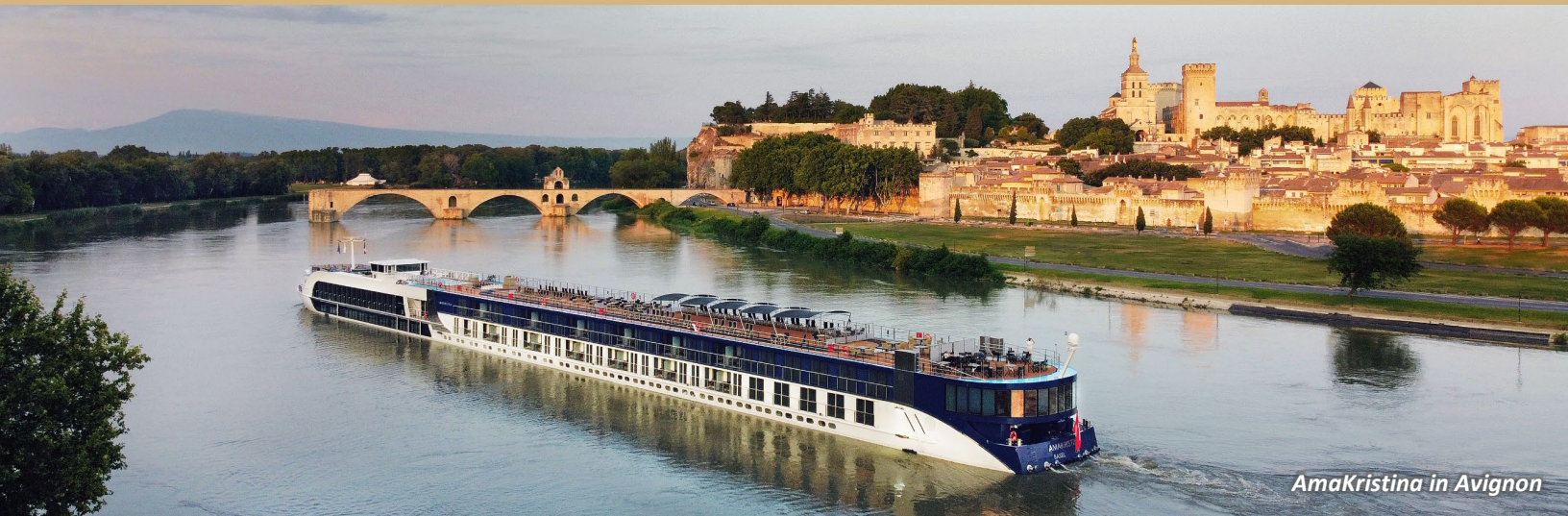
AmaKristina in Avignon

7 NIGHTS • MAY 15 TO 22, 2025 Arles to Lyon – Aboard AmaKristina