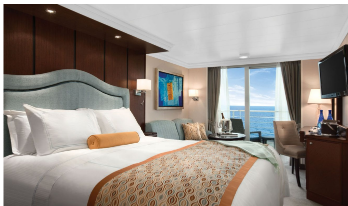
Veranda Stateroom from $14,898 $5,199 pp Square footage: Approx. 282 sq ft (incl balcony) Category B4 to B1

Amenities: Floor-to-ceiling panoramic windows, spacious seating area, queen-sized bed convertible to two twins; over-sized marble and granite bathroom with tub and separate shower, LCD flat-screen television, vanity desk, breakfast table, hair dryer, safe, thick cotton robes and slippers, refrigerated mini-bar, direct dial satellite phone and cellular service