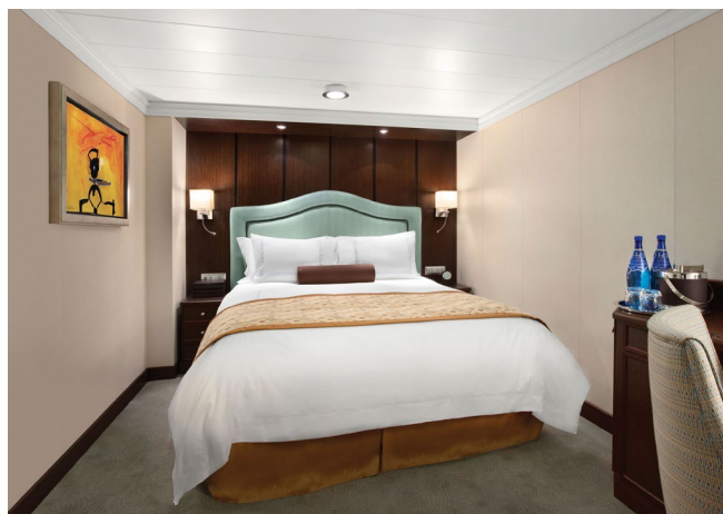
Inside Stateroom from $8,698 $3,599 pp Square footage: Approx. 174 sq ft Category G & F

Special Pricing when you book by December 31, 2024