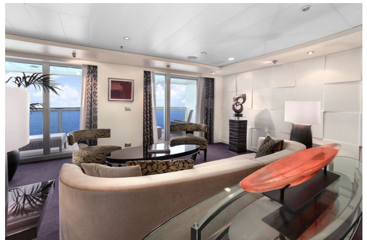
Oceania Suite $24,698 $11,599 pp Square footage: Approx. 1,000 sq ft (including balcony)

Amenities: Expansive private balcony with Jacuzzi; living room, dining room, separate bedroom with a king-size bed; walk-in closet; master bathroom with Jacuzzi bathtub and second bathroom with shower, 50 inch LCD flat-screen television, laptop computer with wireless access, CD/DVD player with an extensive media library, welcome bottle of champagne, refrigerated mini-bar replenished daily, thick cotton robes and slippers, cashmere lap blanket, hair dryer, safe, direct dial satellite phone and cellular service