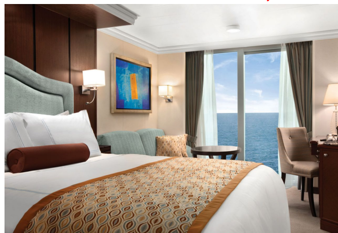
Deluxe Ocean View from $10,498 $4,499 pp Square footage: Approx. 242 sq ft Category C

Amenities: Queen-sized bed convertible to two twins; over-sized marble and granite bathroom with shower, LCD flat-screen television, vanity desk, breakfast table, hair dryer, safe, thick cotton robes and slippers, refrigerated mini-bar, direct dial satellite phone and cellular service