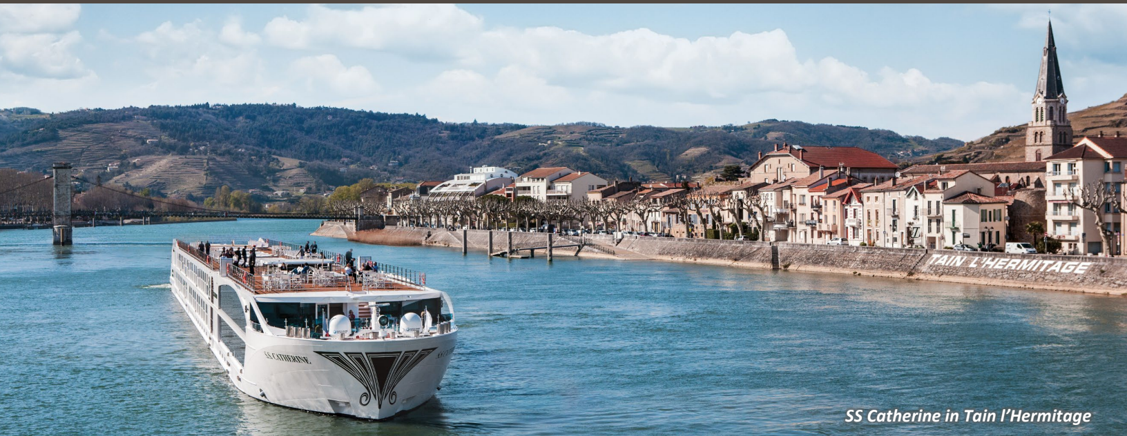
SS Catherine in Tain l'Hermitage

SS CATHERINE › 7 NIGHTS › LYON TO ARLES › APRIL 26 TO MAY 3, 2026