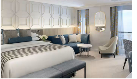
Penthouse Suite Approx. 440 ft<sup>2</sup> (incl balcony) from $4,898