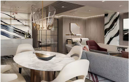
Oceania Suite Approx. 1,000 ft<sup>2</sup> (incl balcony) from $8,498