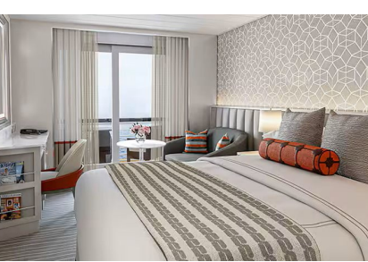
Veranda Stateroom Approx. 291 ft<sup>2</sup> (incl balcony) from $3,498