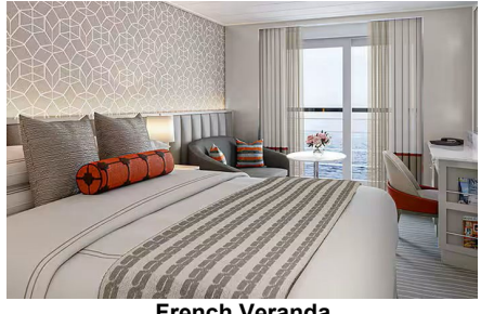
French Veranda Approx. 240 ft<sup>2</sup> from $3,098

Set sail aboard Oceania's newest ship, Allura, for a wine cruise experience that will be truly unique. Oceania Cruises' beautiful 1,200 passenger Allura will be your home. This unique experience of a smaller ship, which features large, well-appointed staterooms with floor to ceiling windows and renowned for their culinary excellence, are among the many reasons Oceania Cruises is our choice for our exclusive wine cruises. Destination focused with like-minded travelers, Oceania Allura is the perfect setting!