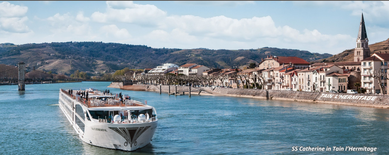
SS Catherine in Tain l'Hermitage

SS CATHERINE › 7 NIGHTS › LYON TO ARLES › APRIL 26 TO MAY 3, 2026