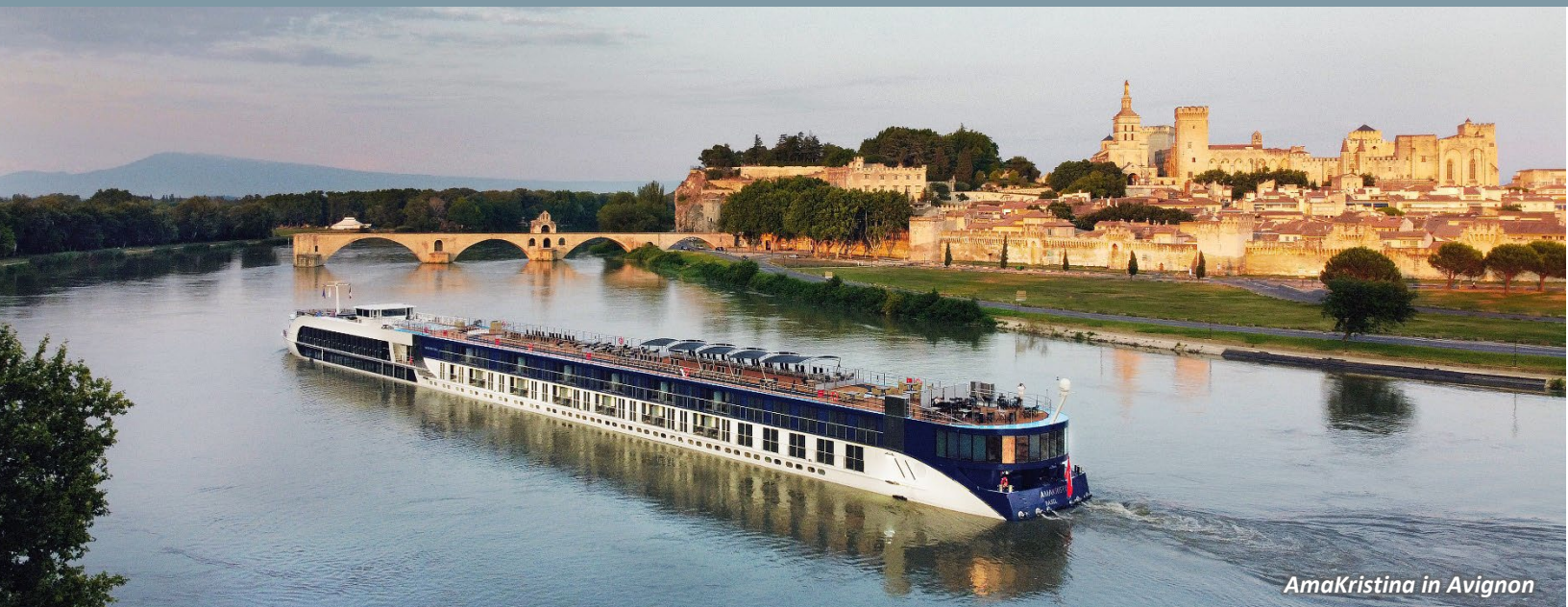
AmaKristina in Avignon

ABOARD AMAKRISTINA • 7 NIGHTS • APRIL 23 TO 30, 2026 Lyon • Vienne • Tournon • Viviers • Avignon • Arles