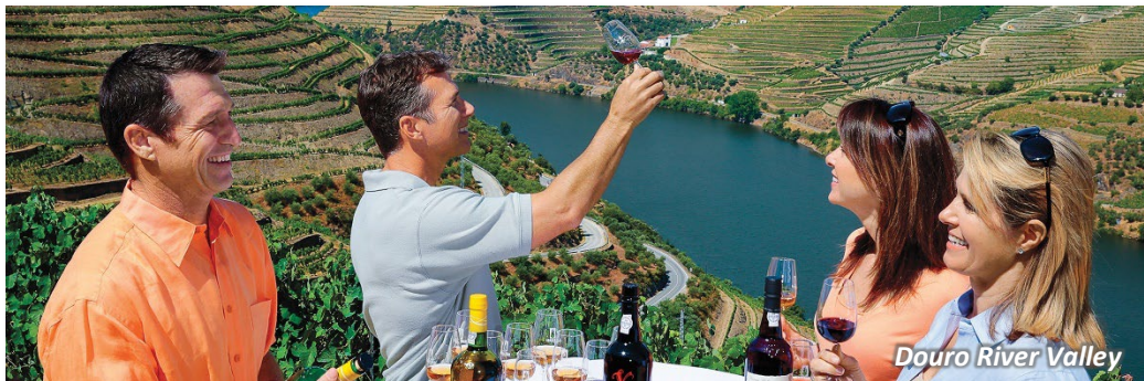
Douro River Valley