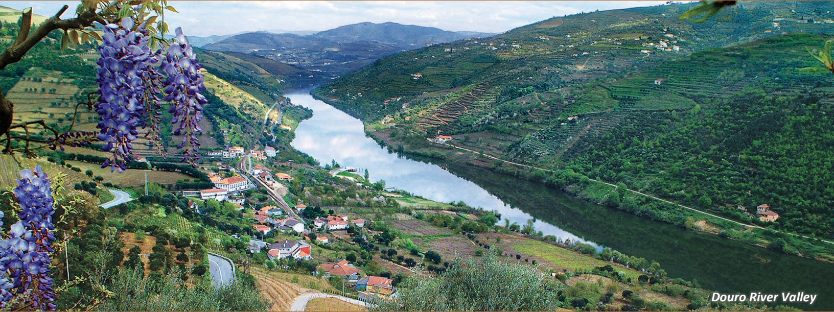
Douro River Valley

ABOARD AMADOURO • 7 NIGHTS • APRIL 7 TO 14, 2026 PORTO • RÉGUA • BARCA D'ALVA • VEGA DE TERRÓN • PINHÃO • ENTRE-OS-RIOS • PORTO