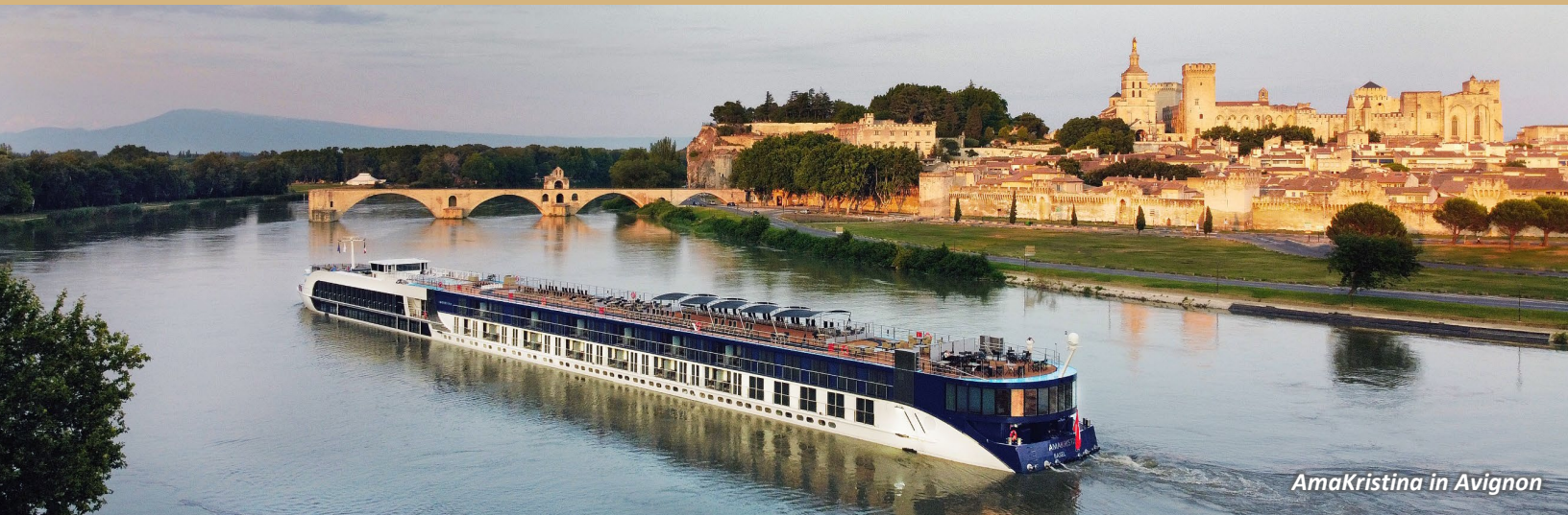
AmaKristina in Avignon

7 NIGHTS • MAY 15 TO 22, 2025 Arles to Lyon – Aboard AmaKristina