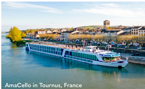
AmaCello in Tournus, France