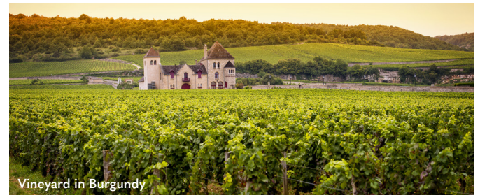
Vineyard in Burgundy

Optional land packages: Pre-cruise 3 nights in Paris from $1,590 per person; Post-cruise 3 nights in Geneva from $1,590 per person.