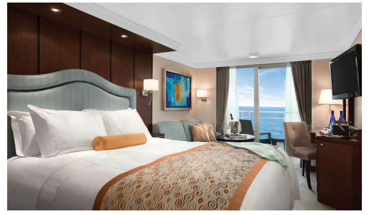
Veranda Stateroom from $11,898 $5,199 pp Square footage: Approx. 282 sq ft (incl balcony) Category B4 to B1

Amenities: Floor-to-ceiling panoramic windows, spacious seating area, queen-sized bed convertible to two twins; over-sized marble and granite bathroom with tub and separate shower, LCD flat-screen television, vanity desk, breakfast table, hair dryer, safe, thick cotton robes and slippers, refrigerated mini-bar, direct dial satellite phone and cellular service