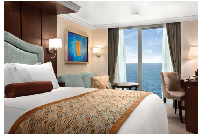
Deluxe Ocean View from $10,498 $4,499 pp Square footage: Approx. 242 sq ft Category C

Amenities: Queen-sized bed convertible to two twins; over-sized marble and granite bathroom with shower, LCD flat-screen television, vanity desk, breakfast table, hair dryer, safe, thick cotton robes and slippers, refrigerated mini-bar, direct dial satellite phone and cellular service