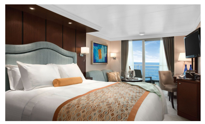
Concierge Level Veranda from $12,598 $5,549 pp Square footage: Approx. 282 sq ft (incl balcony) Category A4 to A1

Amenities: Private balcony, plush seating area, queen-sized bed convertible to two twins; oversized marble and granite bathroom with tub and separate shower, LCD flat-screen television, laptop computer with wireless access, welcome bottle of champagne, cashmere lap blanket, hair dryer, safe, direct dial satellite phone and cellular service