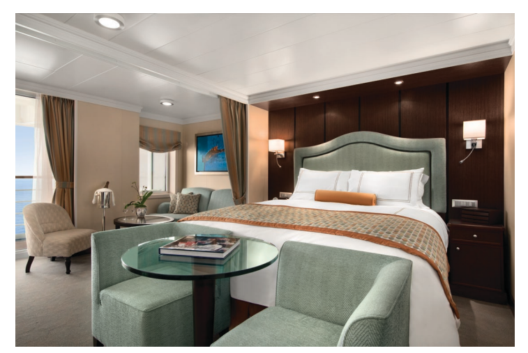
Penthouse Suite from $15,698 $7,099 pp Square footage: Approx. 420 sq ft (incl balcony) Category PH3 to PH1

Amenities: Private balcony, living area, dining area, queen-sized bed convertible to two twins; walk-in closet; large marble and granite-clad bathroom with full-size bathtub and separate shower, LCD flat-screen television, laptop computer with wireless access, welcome bottle of champagne, refrigerated mini-bar replenished daily, lighted vanity, thick cotton robes and slippers, cashmere lap blanket, hair dryer, safe, direct dial satellite phone and cellular service