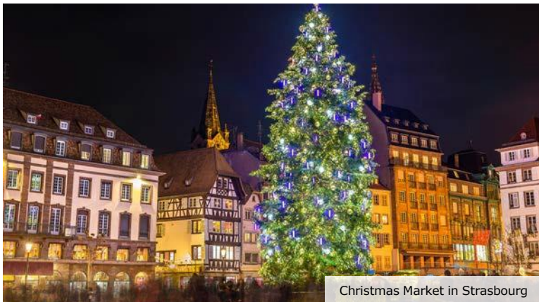
Christmas Market in Strasbourg