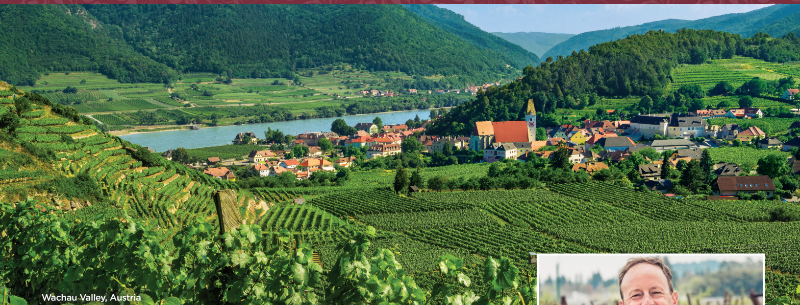
Wachau Valley, Austria

Uncork local traditions, savor intense flavors and enjoy palate-pleasing adventures during an AmaWaterways Wine Cruise