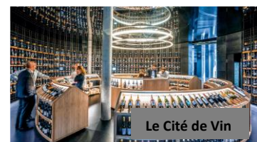
Le Cité de Vin