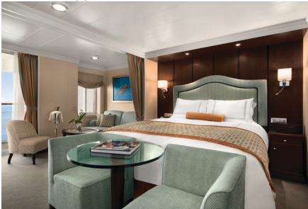
Penthouse Suite Approx. 420 ft 2 (incl balcony) from $6,398