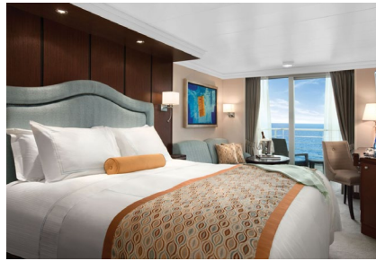
Veranda Stateroom Approx. 282 ft 2 (incl balcony) from $4,898