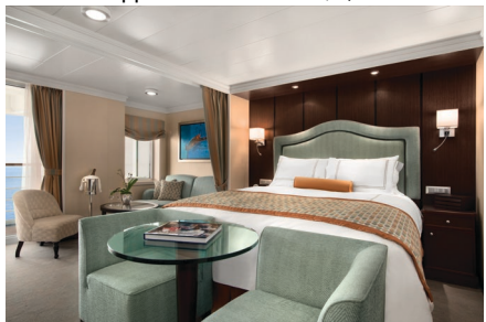
Penthouse Suite Approx. 420 ft 2 (incl balcony) from $6,398