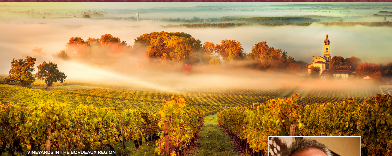
VINEYARDS IN THE BORDEAUX REGION

Uncork local traditions, savor intense flavors and enjoy palate-pleasing adventures during an AmaWaterways Wine Cruise