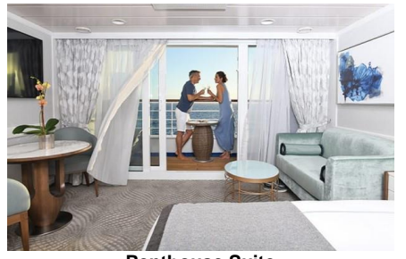
Penthouse Suite Approx. 322 ft² (incl balcony) from $7,198