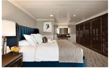
Owner's Suite Approx. 1,000 ft<sup>2</sup> (incl balcony) from $12,298