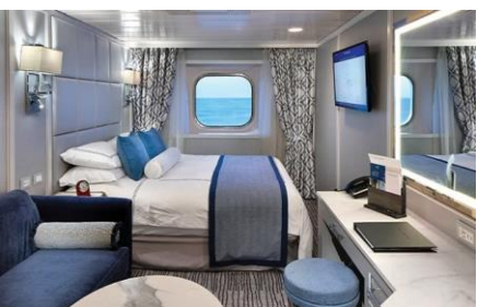
Deluxe Ocean View Approx. 165 ft<sup>2</sup> from $3,598

Better than new, Regatta is the flagship of the Oceania Cruises fleet and features a beautifully re-inspired ambiance. Each luxurious suite and stateroom is entirely new from floor to ceiling, including the bathrooms. Her decks are resplendent in the finest teak, custom stone and tile work, and her lounges, suites and staterooms showcase designer residential furnishings. Regatta offers four unique, open-seating restaurants, the Aquamar Spa + Vitality Center, eight lounges and bars, a casino and 342 lavish suites and sleekly redefined staterooms, nearly 70% of which feature private verandas. With more than 400 crew to serve a maximum of 684 guests, it's no wonder these small and luxurious ships are more than acclaimed – they are legendary.