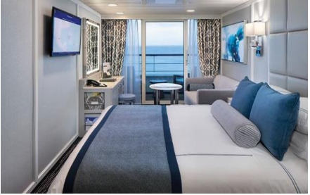
Veranda Stateroom Approx. 216 ft<sup>2</sup> (incl balcony) from $5,098